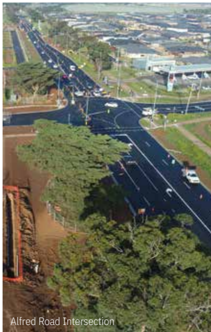
Alfred Road Intersection

Farm Road Intersection – Development Victoria will be upgrading the intersection at Farm Road and Geelong Road to a signalised T-Intersection. In addition to this, the remainder of Farm Road will be upgraded to accommodate increased traffic flows in a safe and efficient way.