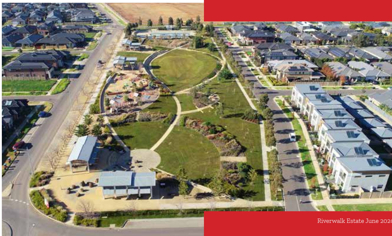
Riverwalk Estate June 2020

Welcome to the third edition of Riverwalk News. While many members of our community have been staying safe at home, work at Riverwalk has been all systems go!